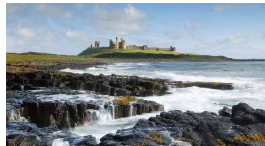
CLOCKWISE FROM MIDDLE ROW, LEFT Wildflowers line the path to Craster; L Robson & Sons , home of the Craster kipper; Dunstanburgh Castle was built on the remains of an Iron Age fort

about the business and would one day follow in the family footsteps. We exchanged elbow bumps and said our goodbyes, vowing to have a kipper breakfast before going home.