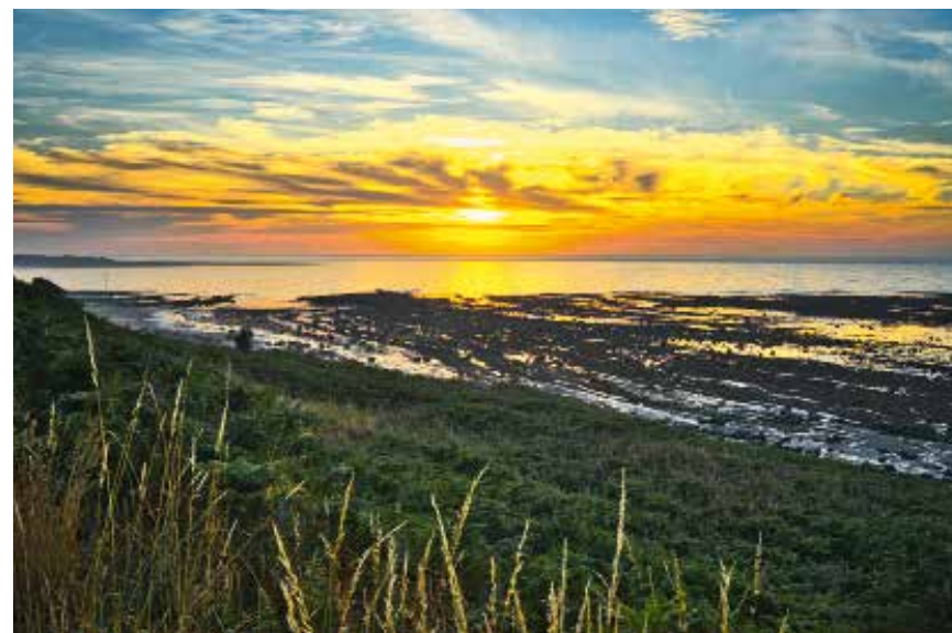
TOP Overlooking Alnmouth, a solitary St Cuthbert's Cross sits on Church Hill, said to be the site where St Cuthbert was chosen as the Bishop of Lindisfarne in 684 ABOVE Wake with the sun to witness a fiery dawn over the shores of Alnmouth Beach

By midday, Mediterranean-style heat had arrived. Our progress was slower than usual as we walked along craggy clifftops with the sound of waves crashing on the rocks below. This was how I had imagined the north-east coastline: brimming with raw and abandoned energy – all the elements my body was now lacking. Fortunately, the fishing village of Craster was around the