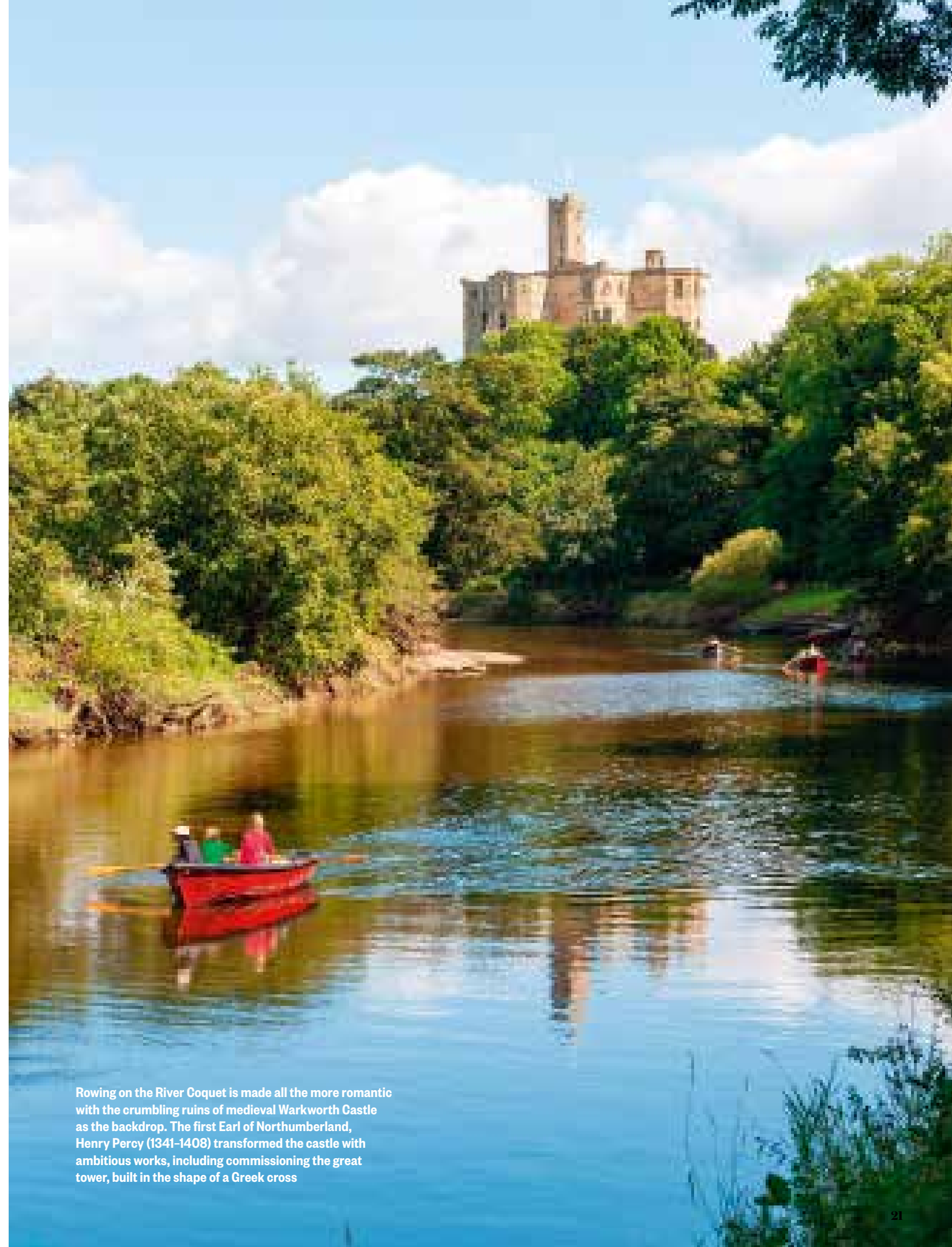
Rowing on the River Coquet is made all the more romantic with the crumbling ruins of medieval Warkworth Castle as the backdrop. The first Earl of Northumberland, Henry Percy (1341–1408) transformed the castle with ambitious works, including commissioning the great tower, built in the shape of a Greek cross

Hiking along paths less travelled has been a passion of mine for many years. My previous adventures in Kyrgyzstan, Greenland and Peru may seem a world away